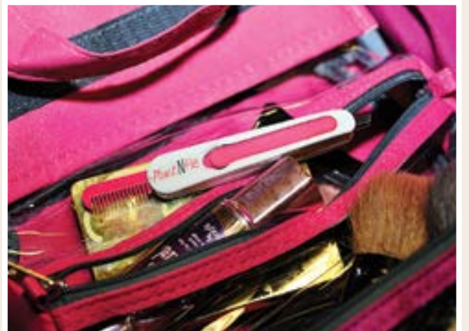
Pluck N' File fits in any makeup bag.

EGT: Have you considered a licensing agreement?