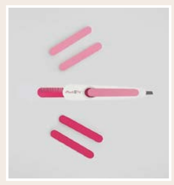
Pluck N' File with additional emery boards.