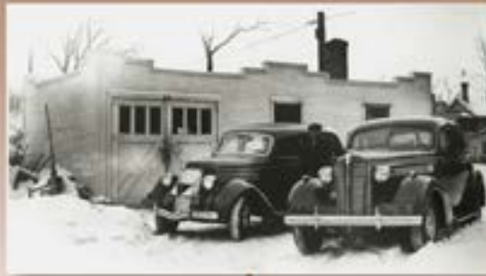
TWIN CITIES, MN.