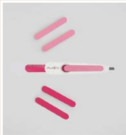
Pluck N' File with additional emery boards.

DMS: Seek out mentors and do your research. LinkedIn and SCORE were a huge help for me. You will learn